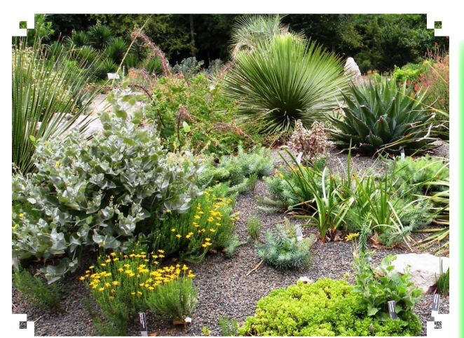
J C Raulston Arboretum • Raleigh, NC (Scree Garden Installed 2006)