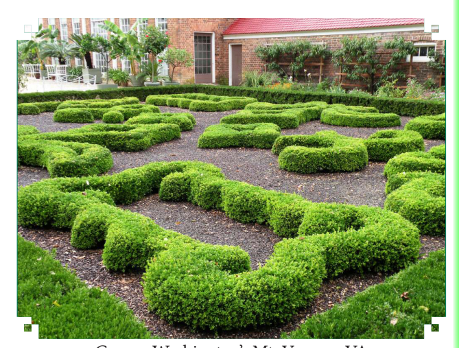
George Washington's Mt. Vernon, VA (Renovated in 2000)